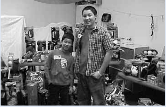
Two of Santa's Cupboard helpers from High Tech Connect assisted families in "shopping" free of charge for gifts for their children. Santa's Cupboard served more than 750 families distributing over 10,000 gifts.